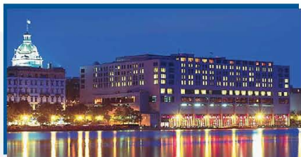
Savannah Hyatt Hotel www.savannah.hyatt.com

The Biennial will be held at the Hyatt Hotel on the riverfront in Savannah, Georgia.