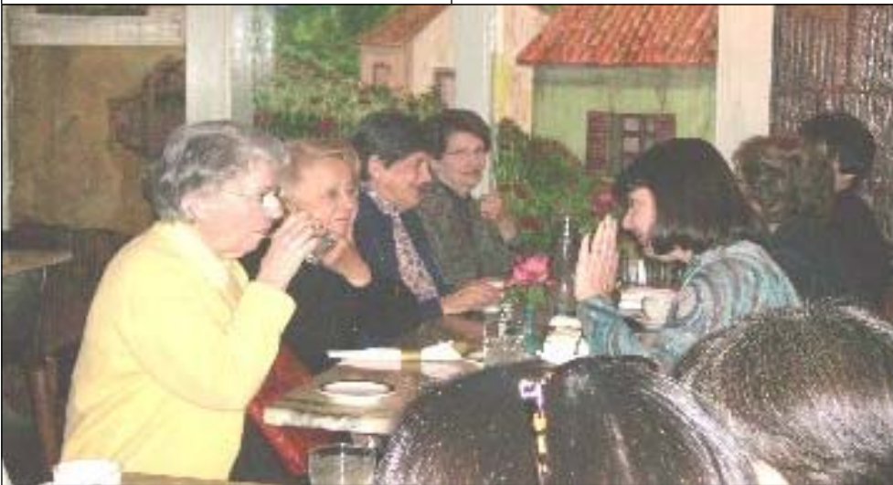
Lunch at Chez Lulu on November 20th by members of L'Chaim League.